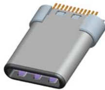
USB Plug PN: 12401562E4#2A