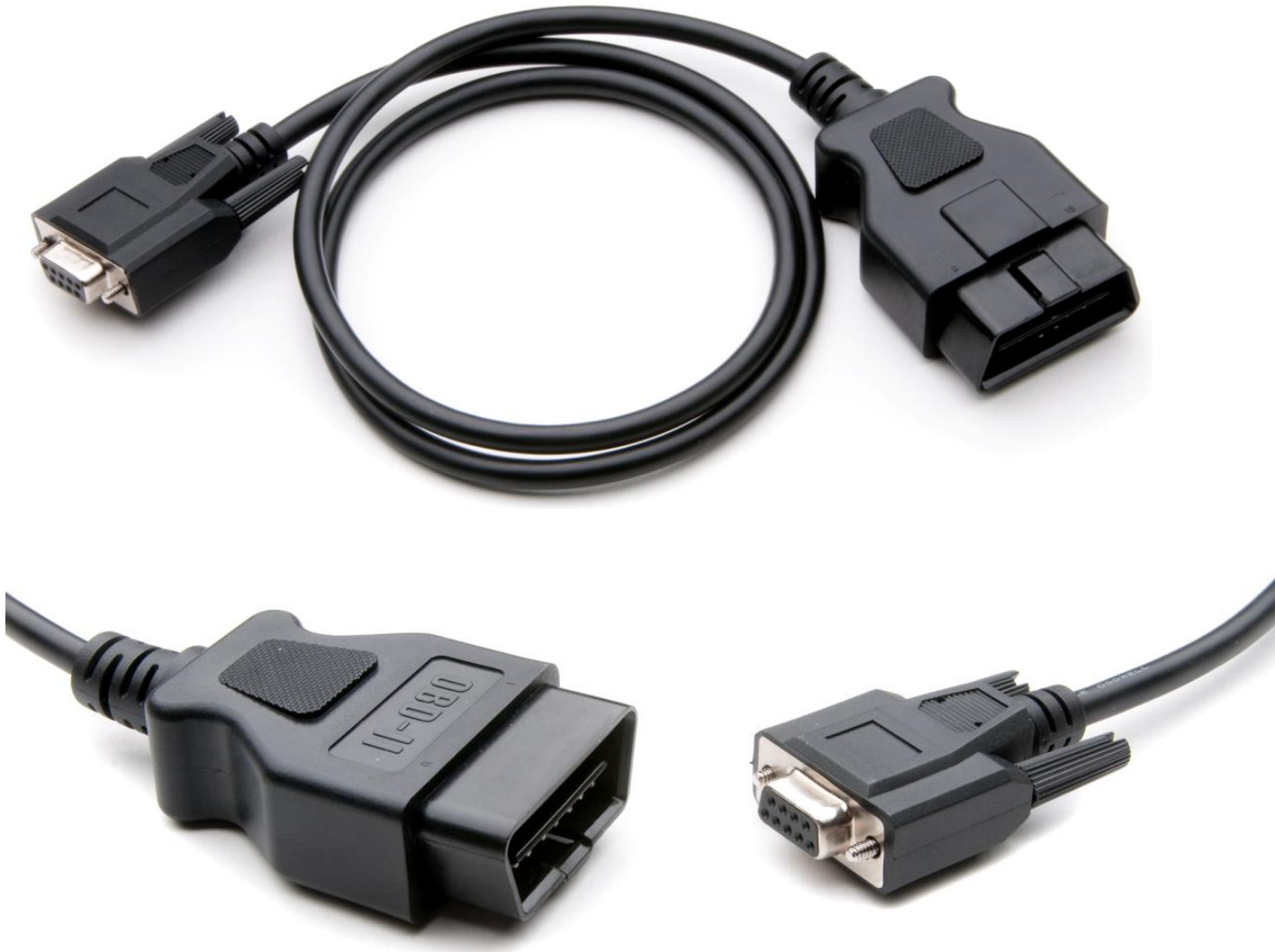
Figure 1-1 OBD-M-DB9-F-ES

The DB9 to OBD-II adapter cable is a simple adapter to allow the EasySYNC range of CANbus products to mate to OBD-II interface connectors commonly used in automotive diagnostics. The DB9 end plugs directly into the EasySYNC CANPlus modules or any CANbus adapter that conforms to the CAN-in-Automation (CiA) DS102-2 pin-out. The OBD-II end plugs directly into an automotive diagnostic port. The cable functions only with the CANbus portion of the OBD-II specification.