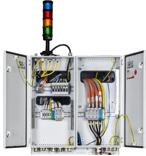
Figure 1. Rear connection cabinets (may differ slightly from actual product)

All SL1200A models have input and output connections that are easy to access and connect. The image below shows the connection cabinets on the rear-top of the system. The left cabinet is for the AC and DC output connections providing power to the device under test. The right cabinet is for the AC input connections providing power to the SL1200A system.