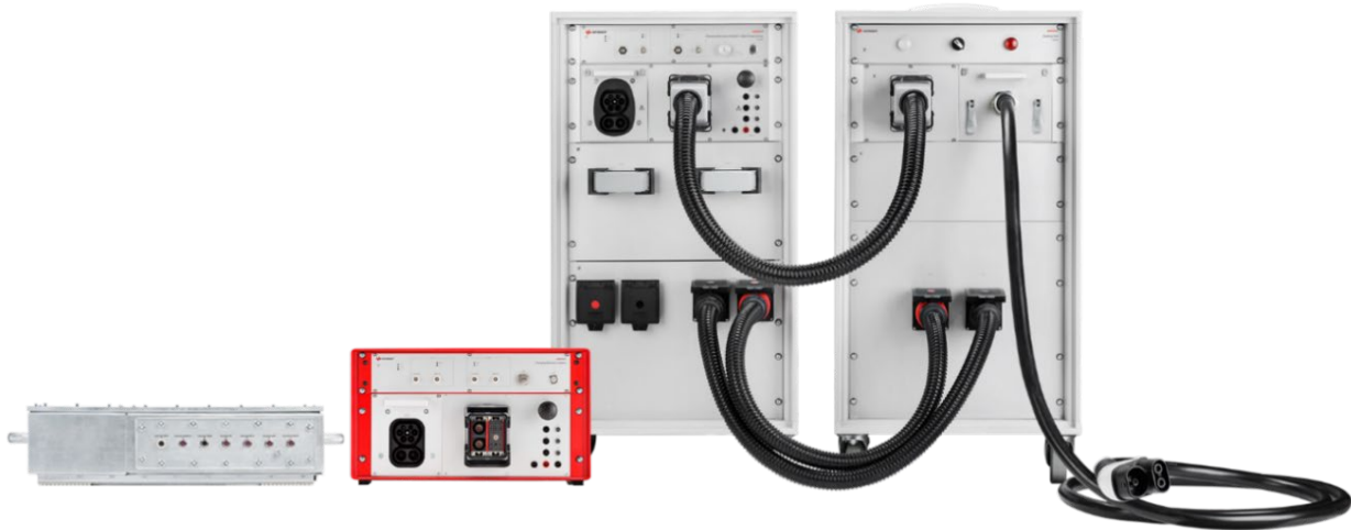
From left to right: SL1040A CDS – EMC Series, SL1040A CDS – Portable Series and SL1047A CDS – High-Power Series

You can get further information to the Scienlab Charging Test Solutions here: