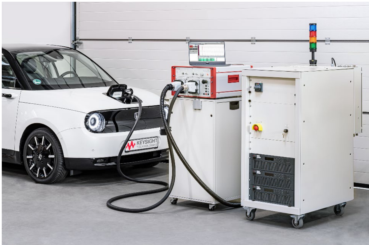
SL1202A 45 kVA AC Emulator with SL1040A Charging Discovery System for EV and EVSE charging test