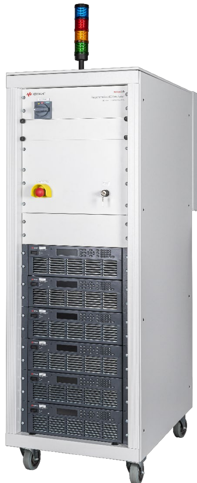
SL1203A 90 kVA

SL1213A – 692 V L-N / 1200 V L-L , 65 A, 90 kVA